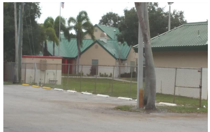
Renovating the buildings and adding to the parking lot at West Ken Lark Park are needed for both existing activities and future plans

West Ken Lark Park will undergo a total renovation, with improvements to the buildings, pavilions and walking trail and new park signage, benches and bleachers.