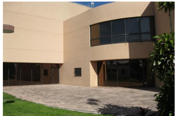
A new awning and patio seating area will be added to the exterior of the Sadkin Center