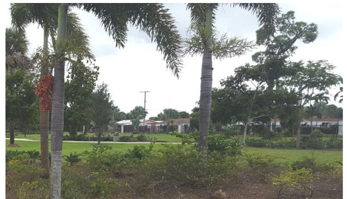
Bradley Park will have amenities added to increase utilization by the community