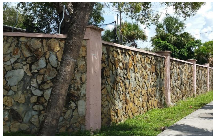
The existing walls on NW 56 Avenue will be replaced