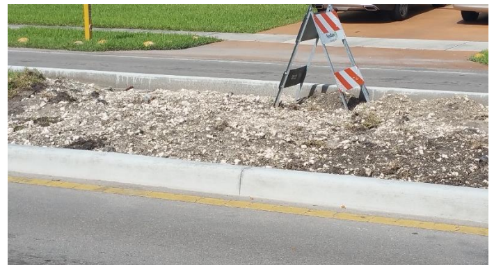
Curbing replacement has been completed allowing landscape and irrigation improvements to proceed